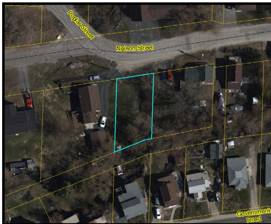
Figure 1: Aerial image indicating the location of the subject property (2019).

An application has been received to change the zoning of the subject property (Figure 1) from "R1" Residential – First Density Zone to "R2" Residential – Second Density Zone.