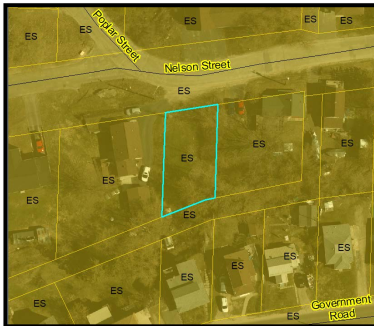
Figure 3 – Official Plan Mapping

Minor changes to land use that are compatible with existing land uses, do not result in significant increases to traffic, dust, odour or noise, are similar in scale to the surrounding built form, and that improve the quality of life for area residents may be permitted through an amendment to the zoning by-law (Section 4.1).