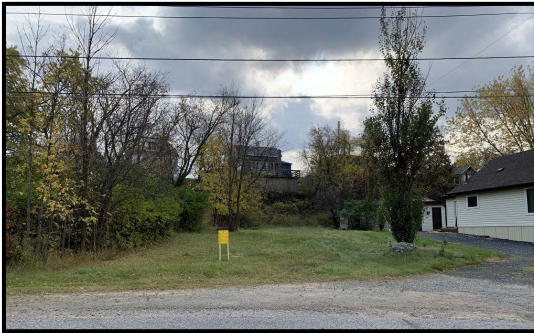
Figure 2 – Photo of the property from Nelson Street.

On October 12, 2022, I conducted a site visit and took the following photo.